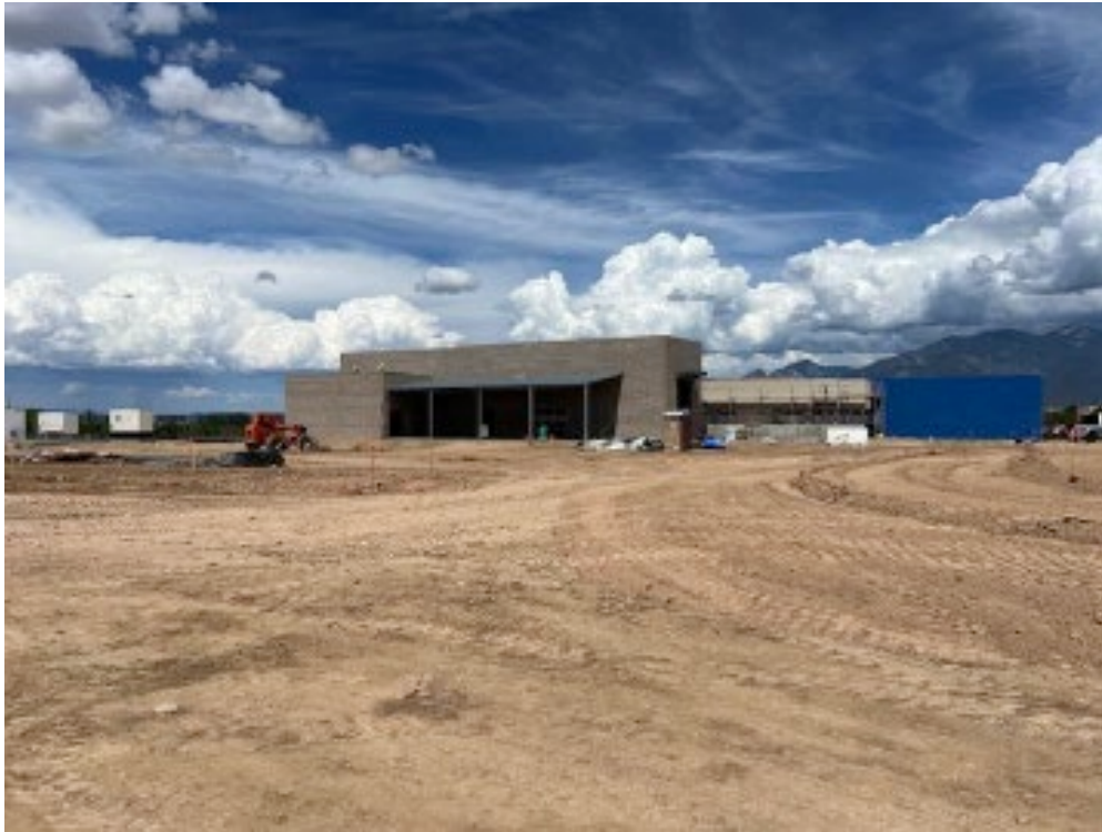
Bus Wash Canopy / Surveying Markers