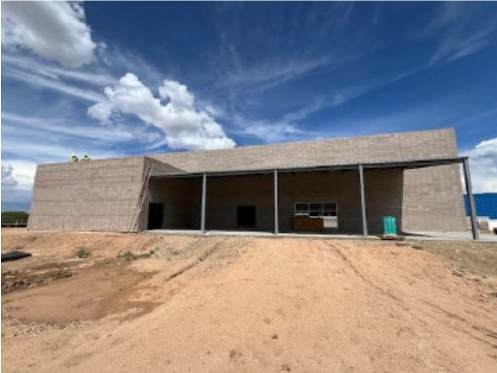
Parapet Board Installation