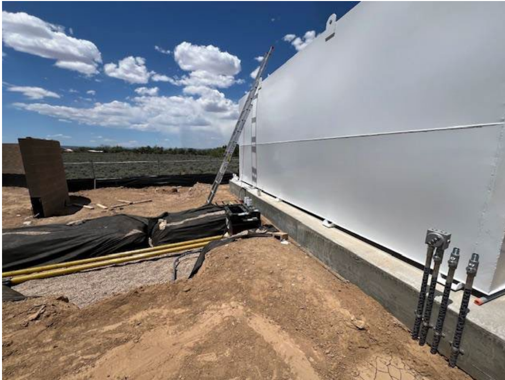
Fuel storage and fuel line installation