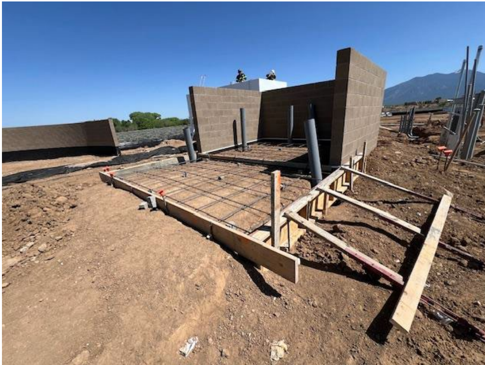
Dumpster pad rebar