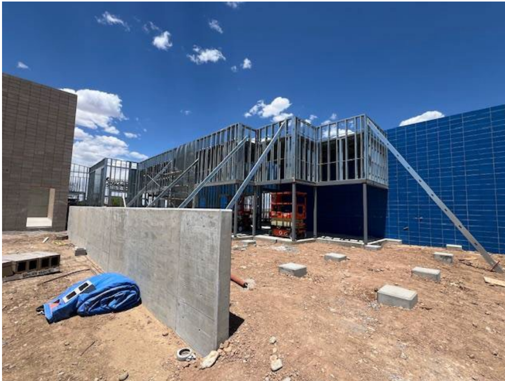
Wall and steel stud erection