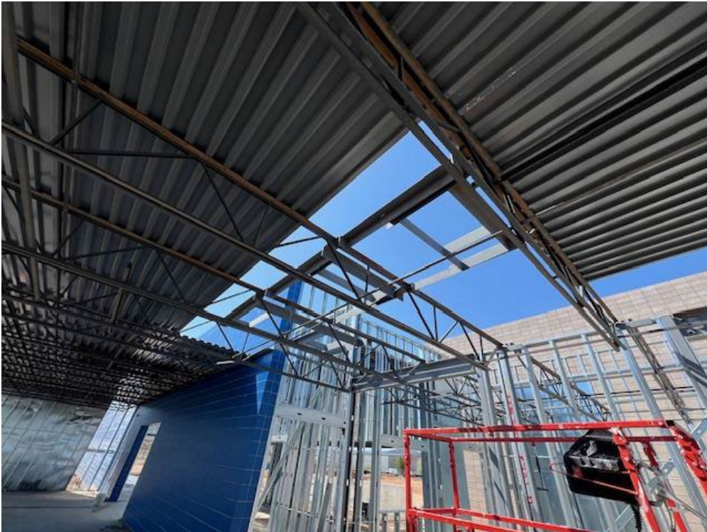
Roof deck, joists