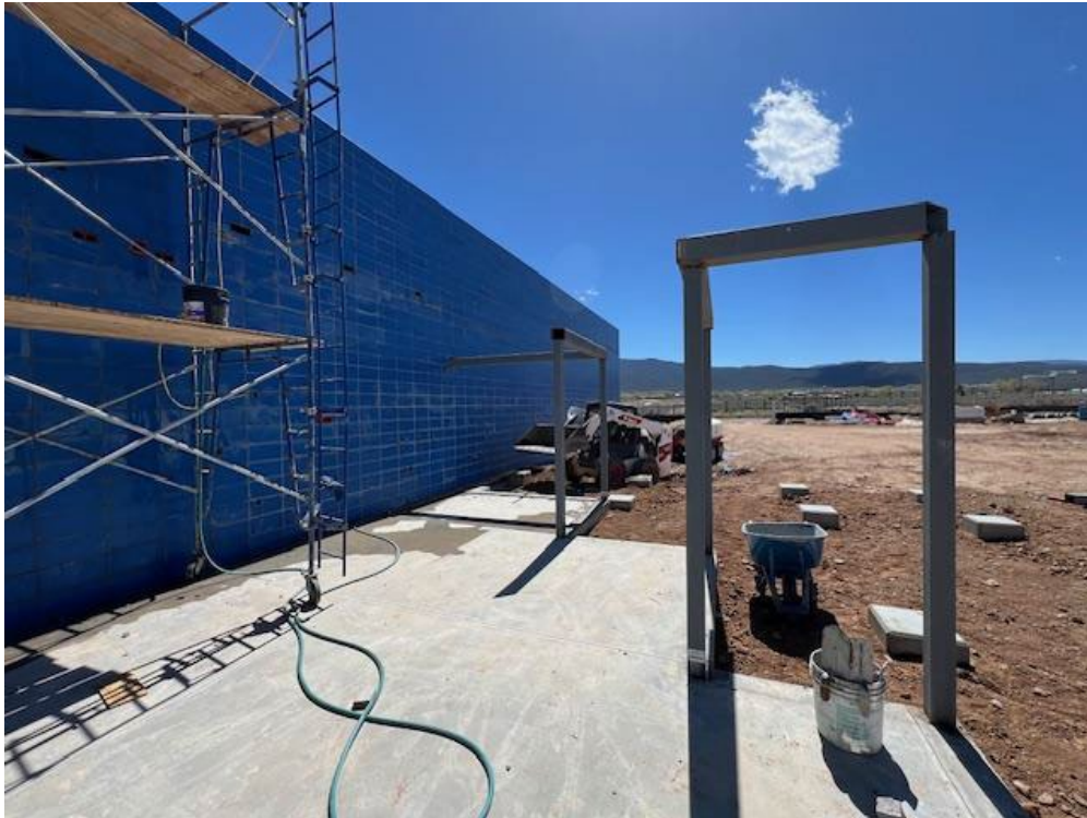
Blue spine wall and steel columns